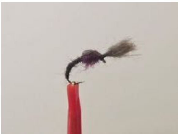
Possum Shaving Brush

Another frequently used Possum Emerger pattern is the Possum Shaving Brush. It appears twice in the 2016 Australia's Best Trout Flies Revisited: under that name in Simon Taylor's contribution; and as a Possum Emerger under Malcolm Crosse's contribution.