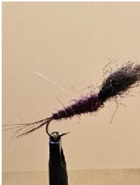
L to R: Possum Parachute Emerger, Possum Wyatt Variant and Forward-wing Possum Emerger

My normal start to dry fishing, if nothing is showing, is to prospect with either the Possum