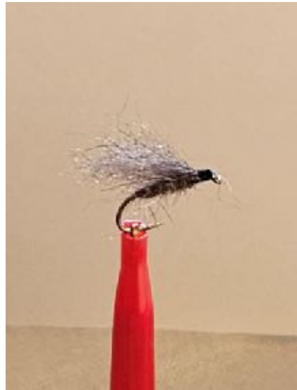
Possum Stone Fly - current tie

In my own case, as many of you will know, I have had a long-time fascination with possum as a fly tying material. My first all-possum fly dates from the early 1980's at Lake Sorell when I tied a sparsely dressed all-possum fly for Stone Fly dry feeders along the Duck Bay shore. That fly was a simple no-hackle job with a lightly dubbed body of natural grey possum body underfur and a back wing of light-ish possum tail (from the base of the tail). I still use that fly occasionally (it has also been re-purposed as a caddis pattern with an orange or green body) and it has been the precursor, for me, to a number of other all-possum and possum plus hackle flies.