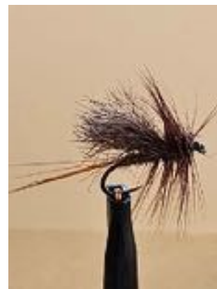
Possum back-wing Barry Lodge Emerger

Also, I use it extensively for wings, both with hackle and without. A favourite is my possum-wing Barry Lodge Emerger tied with a dyed dark brown possum fur body and a sparsely tied cut possum back wing.