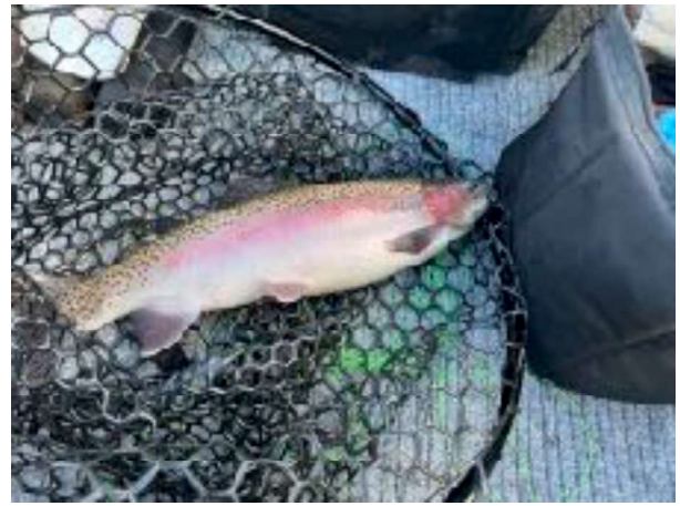
Talbots rainbow 3/8/24