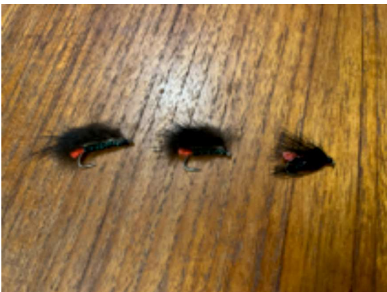
Flies that worked back in the day

We spent the night at the Sorell shack, ate and drank very well in front of a fantastic fire. It is a brilliant little shack now and will only become more appealing when the renovations take place in the near future.